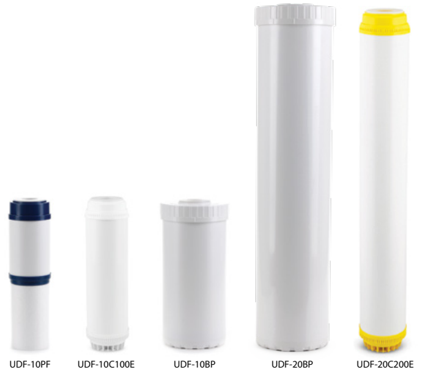
UDF Series GAC / Carbon / Media Filter

40 °F to 125 °F (4.4 °C to 51.7 °C) Min. Working Pressure: 20 psi Max. Working Pressure: 125 psi