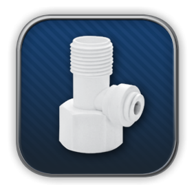
Feed Water Adaptor