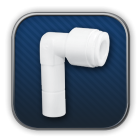
Plug In Elbow