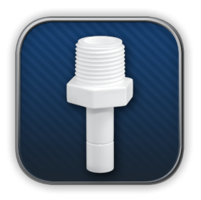
Male Stem Adaptor