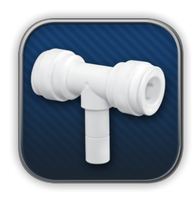
Stem Branch Tee