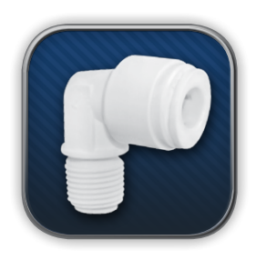
Elbow Check Valve