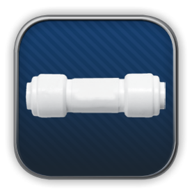
Inline Check Valve