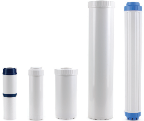
UDF Series GAC Carbon / Media Filter

40°F to 125°F (4.4°C to 51.7°C) Min. Working Pressure: 20 PSI Max. Working Pressure: 125 PSI